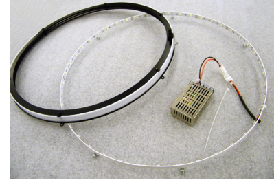
Kit for TGV 950