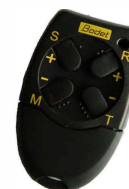
Wireless remote control