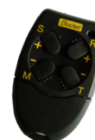
Wireless remote control